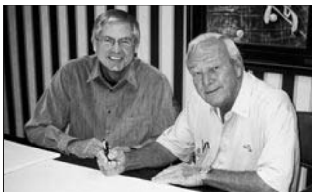
Palmer, right, who turns 79 this year, signs a print of "Gratitude."