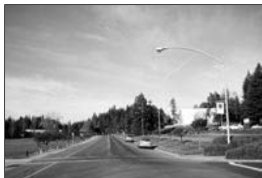
Howell Mountain Road as it currently looks as you drive into Angwin.

On the following pages, ViewPoint outlines the current concepts and vision for the Eco-Village and takes a look at what's in store for the future of PUC.