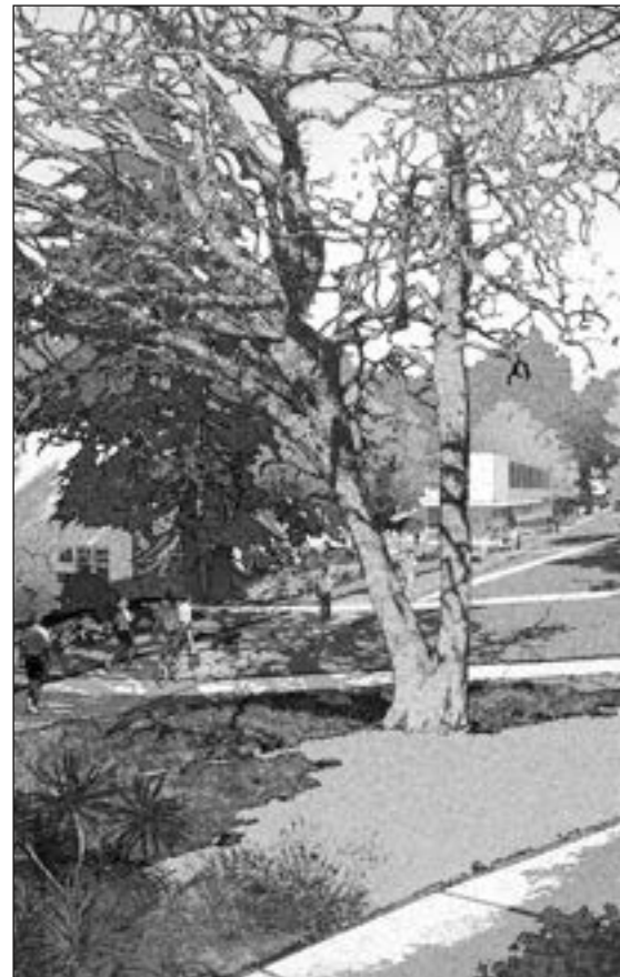
Under the proposed campus master plan, old Howell Mountain Road (right), which runs through the center of campus, would be replaced by “the glade,” a lush stretch of grass and more pedestrian-friendly walkways (artist rendering above).