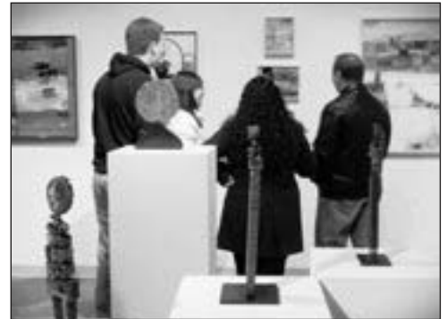
Eleven full-time and contract visual arts faculty members shared their work at the art show.

The visual arts department offers majors in fine art, photography, graphic design, and film and television; and minors in art history and art. It is one of the most popular departments on campus, with nearly 100 students enrolled in various programs.