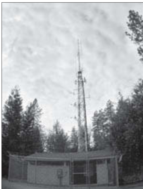
The new Verizon antenna was installed on an existing tower on campus in November.

It wasn’t long ago when frustrated cell phone users would congregate at certain points on campus, straining their ears to hear the jumbled words of the person on the other end, all the while shouting into their phone, “Can you hear me now?!” The walk around campus seemed like a perpetual advertisement for Verizon, the wireless carrier to which the infamous slogan can be attributed. However, somebody at the company must have heard the plea for adequate reception because on November 3, 2006, Verizon completed construction of an antenna located behind Nichol Hall.