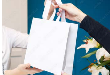
Welcome bag filled with comfort items.

Many of the Ukrainian students have been displaced by the war and are living as refugees in other parts of Ukraine as well as in other countries. Your gift of transportation will allow these students to travel to their final destination in the Napa Valley.