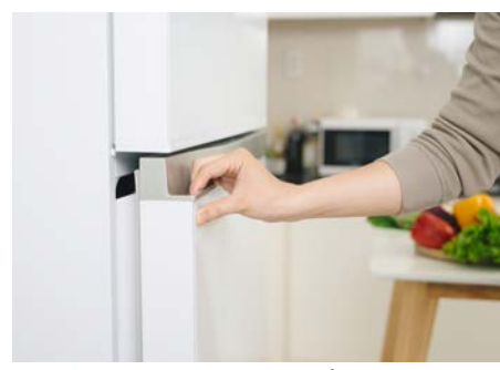
Kitchenette Kit-$300.00 Basic dorm room kitchenette items.