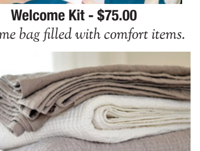
Bedroom Kit - $250.00 Basic bedroom necessities.