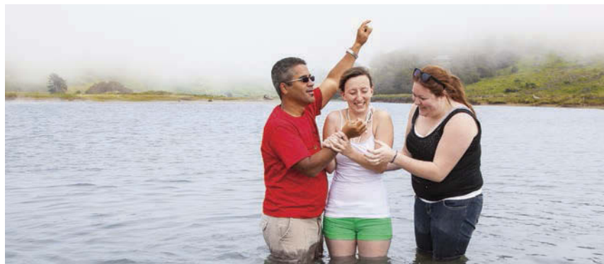
Beauty of Grace Students committ their lives to Christ through baptism on the final day of PUC's Student Week of Prayer.