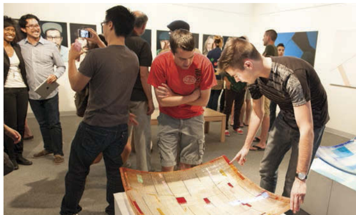
Final Projects Visitors admire the work of PUC students at the 2013 senior thesis exhibition in the Rasmussen Art Gallery.