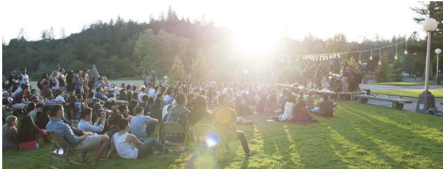
Music with Mission Students enjoy the REVOfest '13 benefit concert for LOVE146, an organization working to end child trafficking and exploitation.