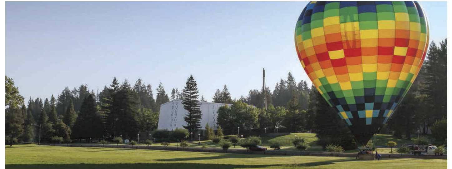
Hot Air Balloons Summer is full of spectacular mornings on Howell Mountain, home to "America's Most Beautiful College Campus" (Newsweek, 2012)!