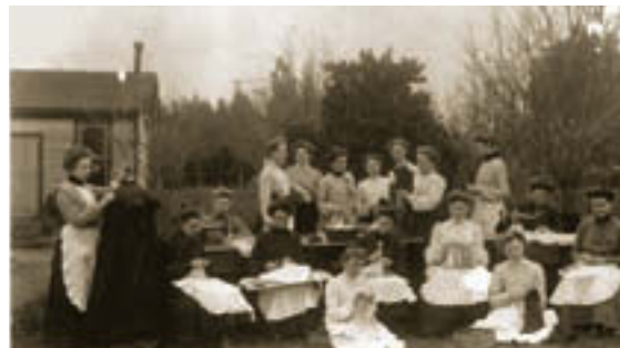
Even in high collars and long skirts, students found quality teaching at PUC.

In theme two we will focus on good planning for the future. We will determine what we need in terms of buildings, equipment, and people to support a quality academic program. Crucial to this work will be the creation of a solid endowment so that we can improve student scholarships and pay our bills and our staff in this beautiful, expensive place.