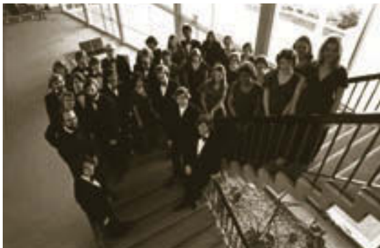
Collaborative projects and ensembles have been a part of PUC's quest for a balanced role in the Adventist community.

In short, the post-graduate transition from PUC to the working world was anything but smooth, but neither was it akin to falling out of a coddled nest. The difficulty was simply due to the fact that people are different everywhere you go, and for the first time, I was alone in a place where faith was not taken seriously. A public school in cosmopolitan France would normally be considered a prime sample of the real world. But in fact, I only found myself living in a different bubble, no more real than ours. It was then that I realized that PUC had in fact prepared me to live in the real world, because it belonged to it and had just as valid a claim to it.