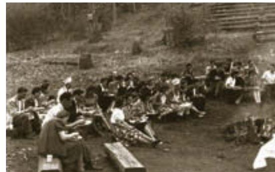
Like Shelton, early students and teachers found a Christian community at PUC.

For the past 10 years, I’ve been road testing the things I learned at PUC. Without exception, every key