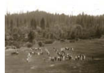
The scenic setting, seen here in the early 1900s, is part of PUC's identity.

After 38 years as an Adventist educator and administrator, I've discovered that PUC's impact on the world of Adventist higher education goes far beyond beauty, to larger contributions. I learned that PUC is: