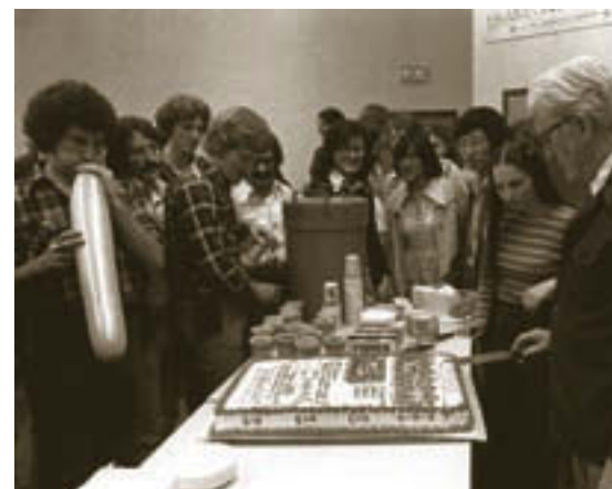
Excellence, through the years, has meant everything from diplomas to birthday parties for professors.