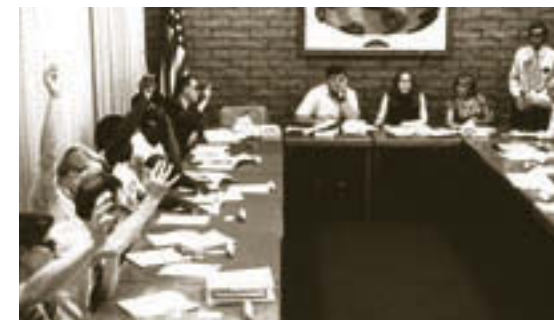
As students have been educated in this Adventist community, they've continued to ask how it will carry over in the after-graduation world.

None of this should have come as a surprise. Although statistics say that a majority of French citizens are Catholic, I think that's only because most people are afraid of marking "Atheist" on a census, just in case. Christianity has been out of style here since the French Revolution, when they guillotined the Catholic Church along with Marie Antoinette and Louis XVI. So naturally, when I tell people I am Christian, I usually elicit one of two reactions. Either people smile condescendingly as if I am a darling relic of medieval naiveté, or they grimace and proceed to tell me how I feel about abortion and George Bush. Nevertheless, I refuse to give in to the notion that people who dismiss religion with a plethora of "-ism's" are any more entitled to call their world the real one.