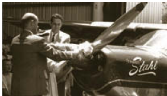
LEFT: A mission plane is christened at the Angwin Airport. RIGHT: The missionary map is still lit every year.

Often within the Adventist community, we ask ourselves if we are living in the "real world." We place a major emphasis on preparing students for their great venture into that "world," which everyone assumes emerges just beyond the church foyer. Yes, anyone who is Adventist has heard of the Adventist bubble.