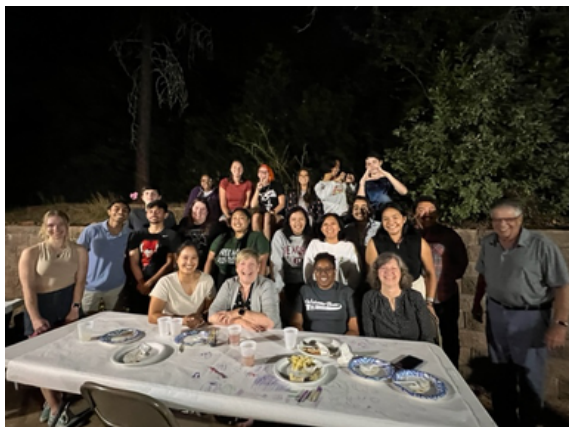
Education Department Pre-Vespers