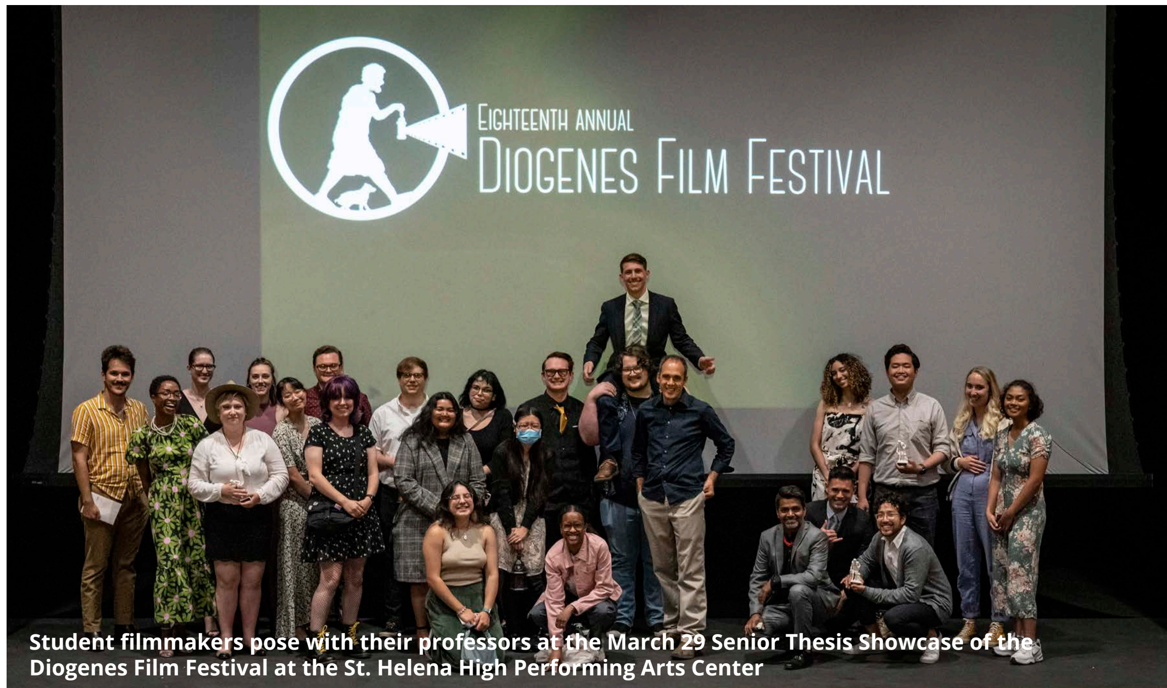
Student filmmakers pose with their professors at the March 29 Senior Thesis Showcase of the Diogenes Film Festival at the St. Helena High Performing Arts Center