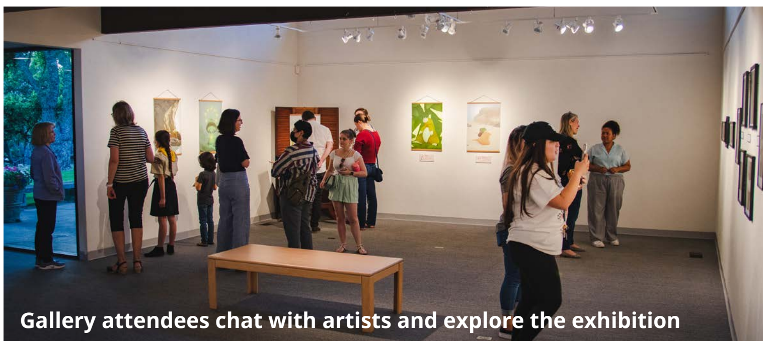
Gallery attendees chat with artists and explore the exhibition