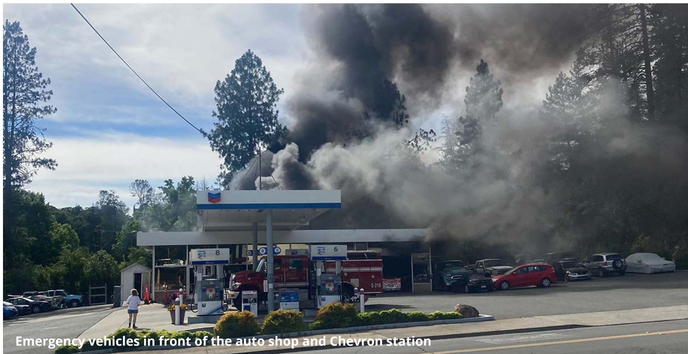
Emergency vehicles in front of the auto shop and Chevron station