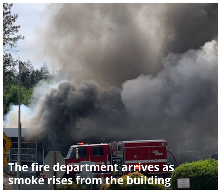
The fire department arrives as smoke rises from the building

The auto shop itself has yet to be assessed to determine whether salvaging it is a viable option. ■