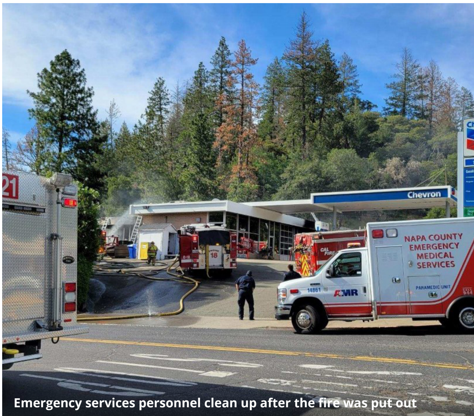
Emergency services personnel clean up after the fire was put out